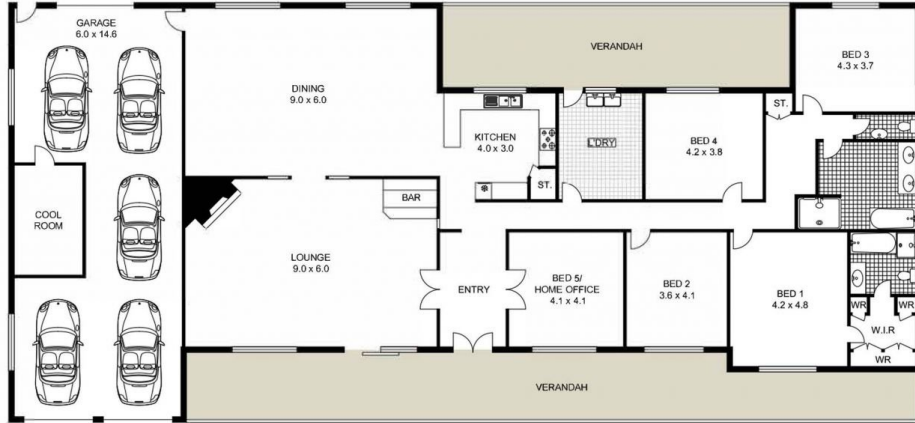
0 1 2 3 4 5m Scale in metres. Indicators only. Dimensions are approximate.