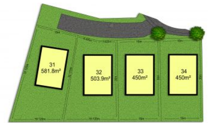
LOTS 31 - 34 CATTAI CREEK DRIVE, KELLYVILLE