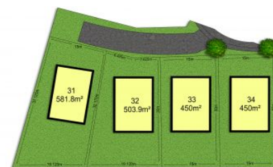
LOTS 31 - 34 CATTAI CREEK DRIVE, KELLYVILLE