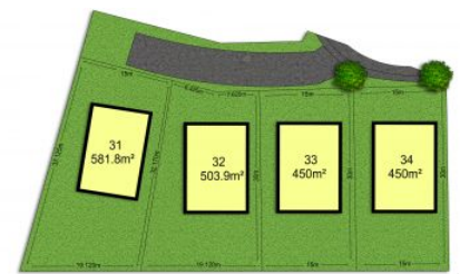
LOTS 31 - 34 CATTAI CREEK DRIVE, KELLYVILLE