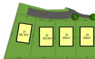
LOTS 31 - 34 CATTAI CREEK DRIVE, KELLYVILLE