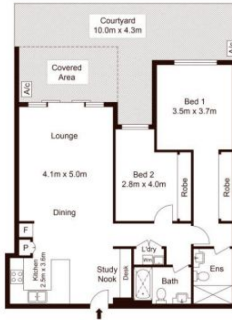
Street / Entry Level