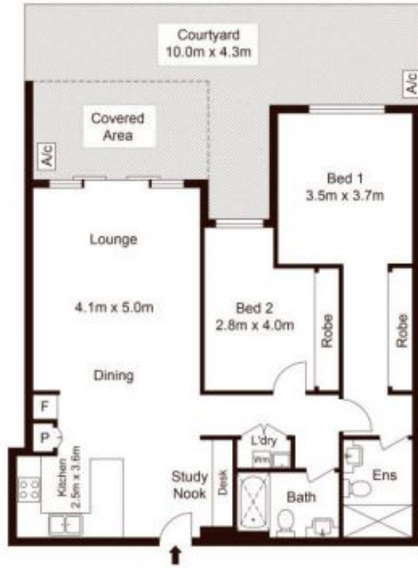
Street / Entry Level